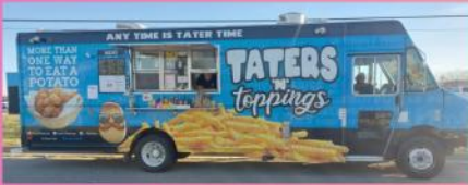
Tater's N Toppings

Friday April 17th 11 a.m. - 2 p.m. On Central in Front of the Courthouse