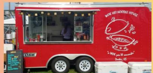
Wok Hei Noodle