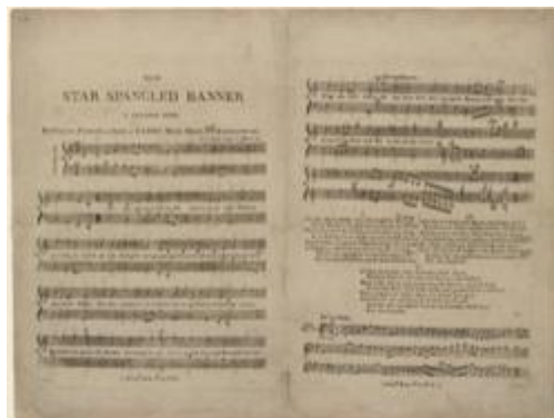
The earliest surviving sheet music of The Star Spangled Banner from 1814.