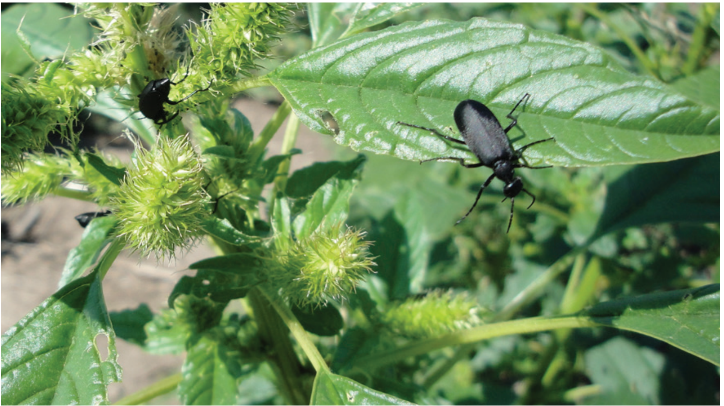
Figure 2. Black blister beetles on the weedy margin of a field. Blister beetles are strongly attracted to pollinating weeds.