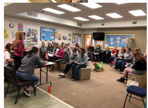
4-H Day Contests, SELF Participants and 4-H Council Meeting