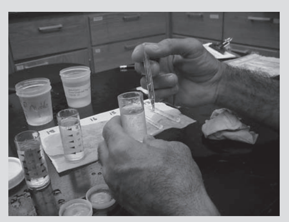
Figure 5-4. Use the bubble to mix the sample. Then read the blue color indicator.