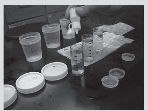
Figure 5-2. Add 25 ml of water to sample vial, then add two drops of activator solution.

We compared several phosphorus test kits to commercial lab results. Some test kits are not accurate, and others are too complex for field