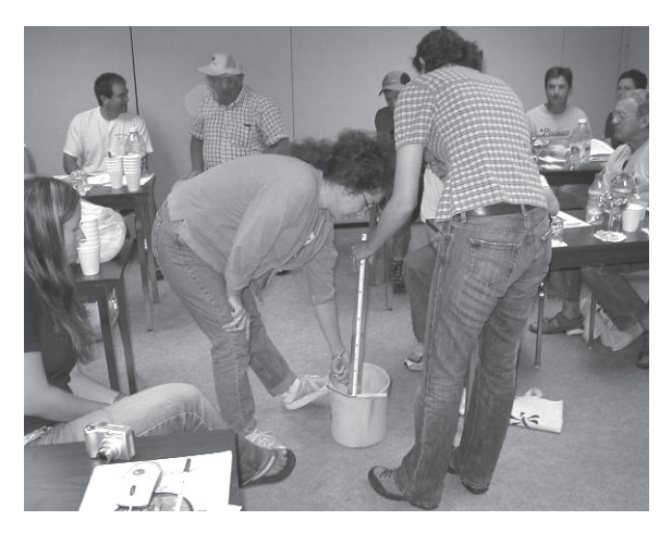
Assemble and practice using equipment before going to the field.

You may dispose of the glass tubes and plastic test strips in your normal household waste, but take care so no one will accidentally get cut on the glass ampoules. The liquid waste and rinse water can be flushed down the sink with extra water into a normal wastewater system. Take your clipboard and data sheet both to the field site and to the location where you run the tests.