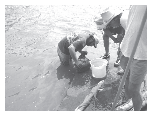
Working with a biologist is a good way to learn about microinvertebrate sampling and identification.

In some states (Alabama and Iowa, for example), adult volunteers are an active part of their state's monitoring effort, and they use test kits similar to those described in these fact sheets. Typically volunteers are trained and certified annually. Data are collected in a standardized fashion and results are posted on Web sites. Fact sheet W-10 in this series lists several state and national programs that offer information, Web sites, and program support that may be helpful to you or your group. The field tests described in this series correlated well with KSU lab results, and could be used with confidence in adult citizen monitoring, as long as standard protocols are