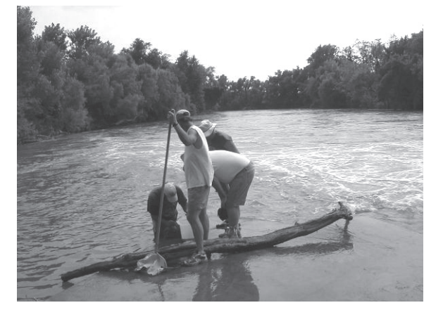
Individuals or groups can sample local rivers for chemical and biological properties or perform a visual site assessment.

If a stream runs though a large part of your property, you may want to sample several spots. For example, an interesting sampling design might be to sample upstream as far as possible, either at the spring that feeds the stream, if it is located on your property, or at the point at which the stream flows from your neighbor's land onto your land.